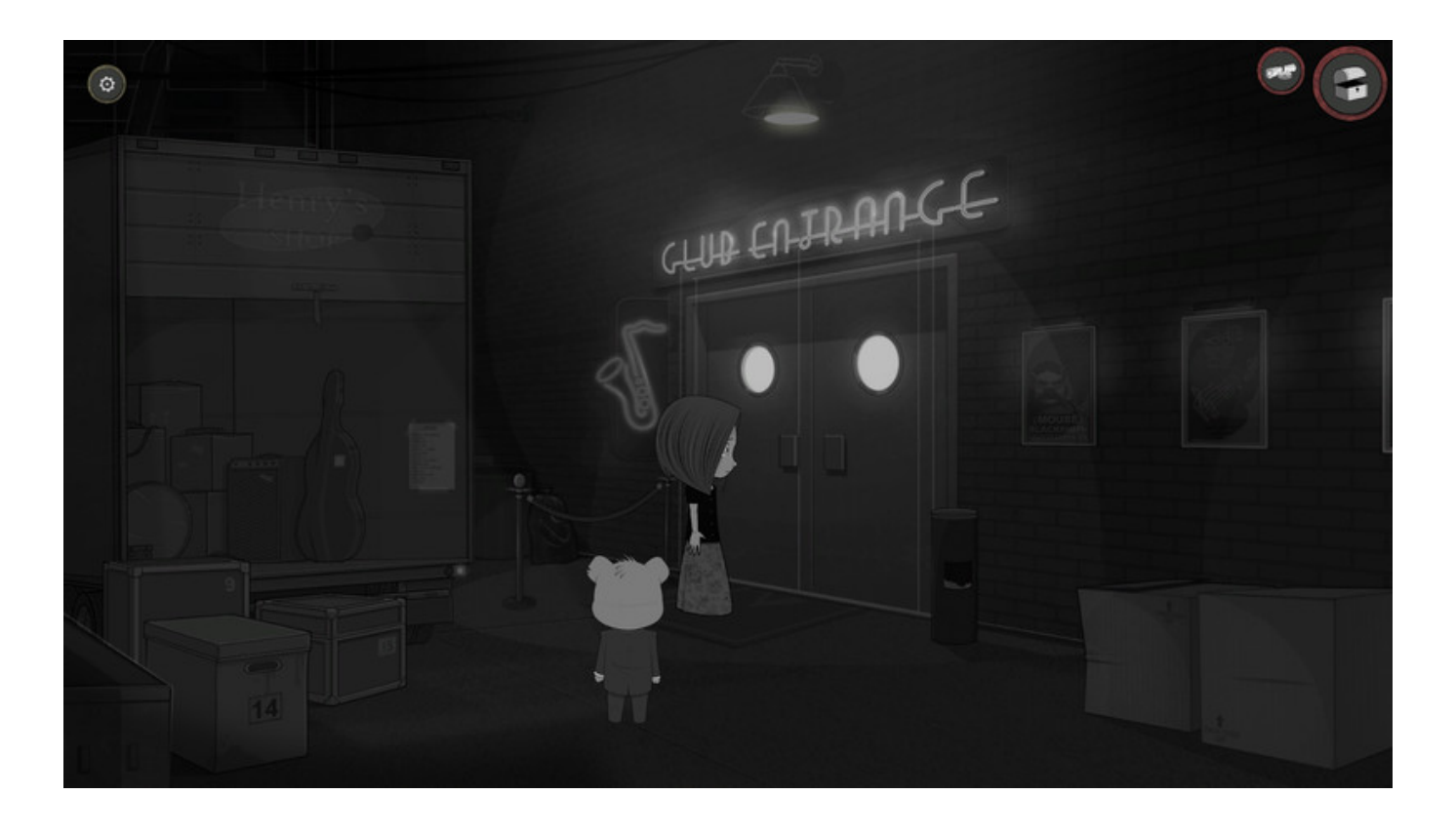
Bear With Me - Episode Two Download For Windows 7